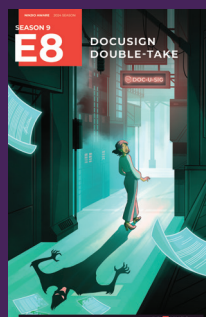
Business Email Compromise